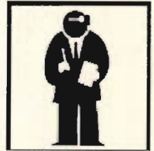
The Probation Officer Acts as a Family Advocate and Enforcer

All conditions are designed to prevent future instances of abuse, to protect and strengthen the family while facilitating rehabilitation for the offender.