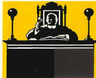
The Courts Make Specific Orders and Hear Violations of Probation

Offenders are held accountable for their behavior through concentrated supervision and enforcement of probation orders of the Court. Offenders who do not comply with conditions of probation are returned to Court on a violation of probation. Probation may, at that time, be revoked and the offender may be ordered to serve additional jail time, or may be committed to State prison.