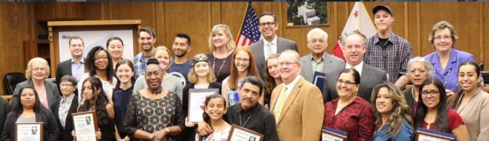
Pictured: Winners of the 2018 Volunteer Recognition Program and County Supervisors

Merced County is accepting nominations for its 2019 Volunteer Recognition Program. To make a nomination, please visit www.countyofmerced.com/volunteer