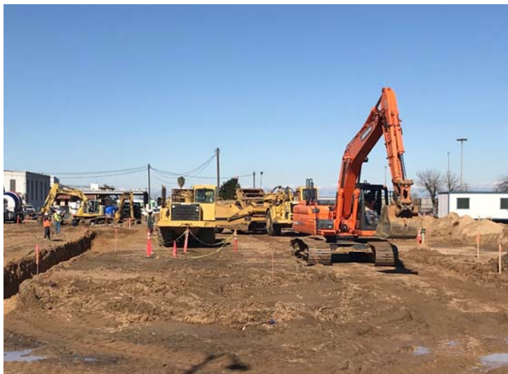
Construction of the Foster Farms expansion project in early February