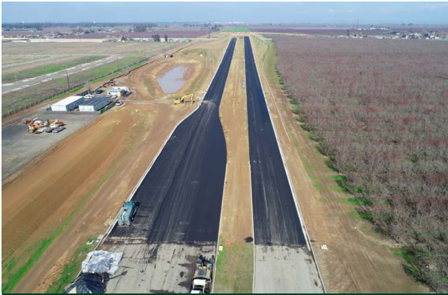
An aerial shot of the progress made on Segment II of the Campus Parkway Project